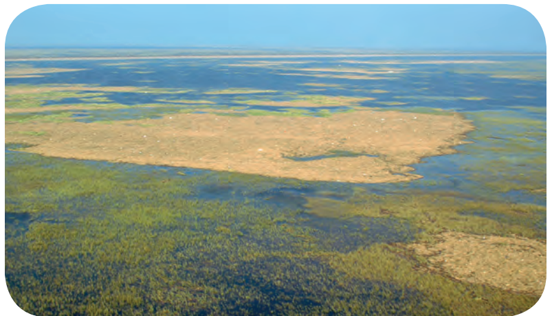
Figure 9. Large wrack deposits and flooded marsh at Sabine National Wildlife Refuge, La.