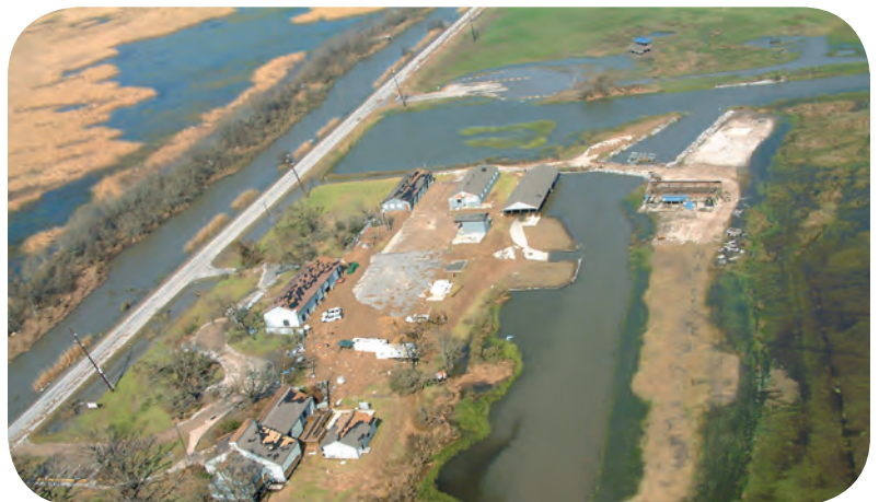
Figure 10. Structural damage and wrack deposition at the headquarters of Sabine National Wildlife Refuge, La.