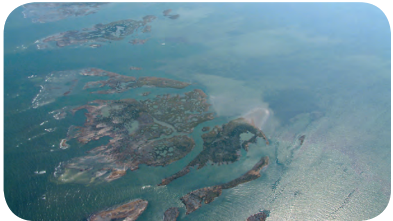
Figure 5. Aerial oblique photograph of Chandeleur Islands, La., after Hurricane Katrina, showing barrier island overwashes, breaches, erosion, and seagrass burial.