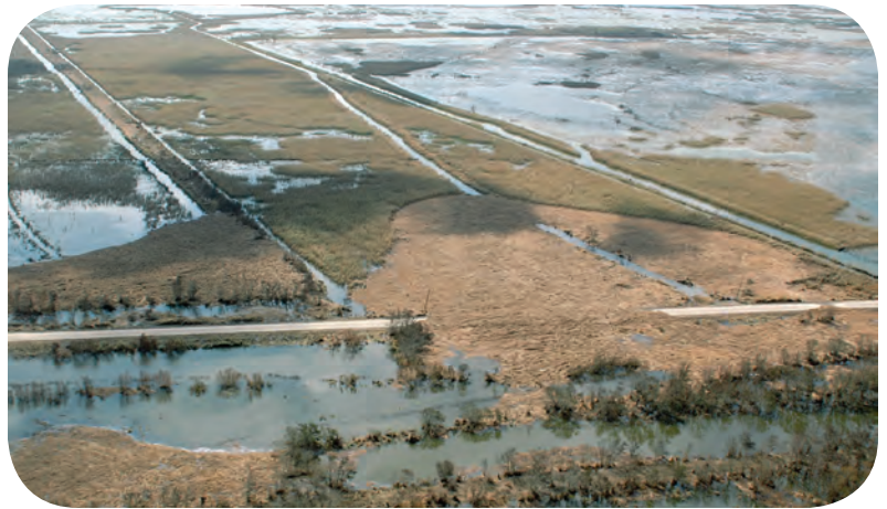
Figure 8. Aerial oblique photograph showing wrack (stems of dead vegetation) deposits over road and marsh, marsh flooding, and tree defoliation near Pecan Island, La.

Stands of common reed ( Phragmites australis ) throughout the coastal zone, especially in the Mississippi River Delta, were tipped or flattened from the winds or storm surge and had turned brown from the high-salinity waters. In other areas, such as most smooth cordgrass ( Spartina alterniflora ) stands, the marsh vegetation seemed healthy and apparently unaffected. In such cases, we surmised that the storm surge resulted in complete inundation of the salt-tolerant plants, which protected them from the high winds