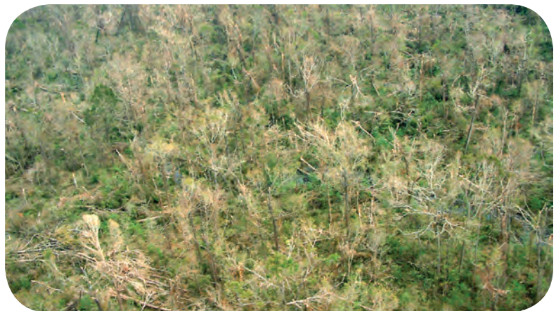
Figure 7. Aerial oblique photograph showing damage to forested wetlands of Pearl River Wildlife Management Area, La., including trees that were snapped, tipped, uprooted, and defoliated.