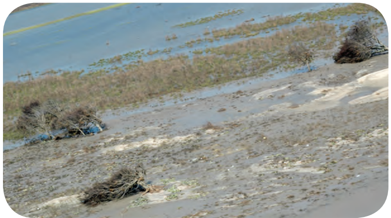
Figure 6. Sediment deposition in marsh, flooded marsh, scoured marsh, tipped trees, and tree defoliation adjacent to the gulf shoreline in the region known as Chenier Plain, La.