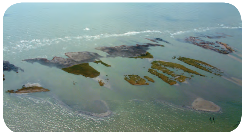
Figure 4. Shoreline erosion, beach displacement, and barrier island breaches and overwash, Timbalier Island, La.