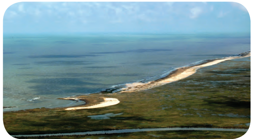
Figure 3. Shoreline erosion and beach displacement on Rockefeller Wildlife Refuge, Cameron Parish, La.

Figure 1 shows tracks of all eight flights taken to assess hurricane damages. For any segment along those tracks, a user (using Arc View™) can zoom in to the specific area to identify specific points where observations were recorded and where photographs were taken. An example of this method is displayed in figure 2 and table 3. Figure 2 shows the flight track of the aircraft during a survey of Raccoon Island, La., on August 30, 2005. A red dot on the flight path indicates a location where a voice observation was made. Four such observations are tagged and identified on the figure, each with a number that corresponds to the observation number (e.g., COL04-16) and an oblique photograph displayed on the image. Table 3 lists the 39 voice observations that were stored in file number COL04. In the ArcView™ (GIS) version of this product, each red dot is hot linked so that the user can click on it and pull up a photograph (such as the images shown), a transcript of the observer's comments, and other information, such as latitude/longitude coordinates and time,